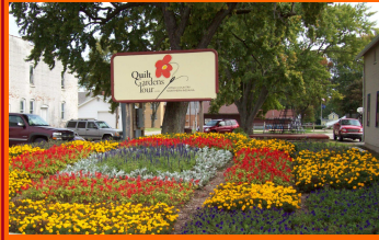
Quilt Gardens viewable from May 25 thru October 1, 2009 QuiltGardenTour.com/800.377.3579

Well-built quality furniture for every room! Specializing in stained glass lamps!